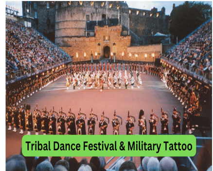
Tribal Dance Festival & Military Tattoo